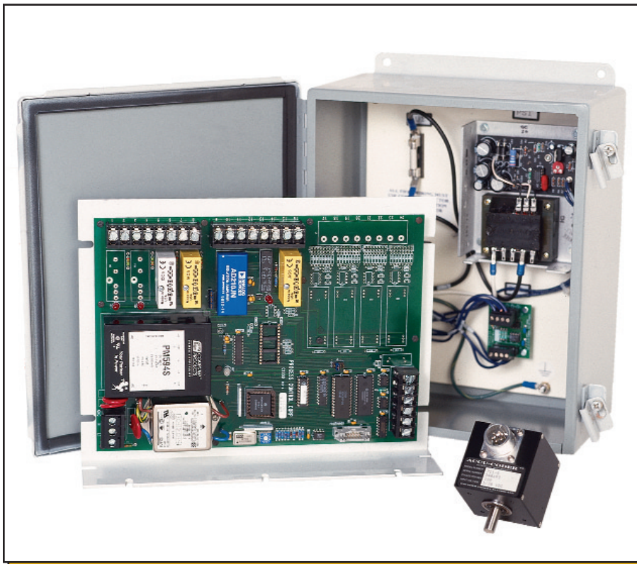
The Gravitrol® System: complete gravimetric extrusion control via drive speed control and line speed control (Pictured above is an EXL card with pulse generator and encoder)

Process Control's Gravitrol® Gravimetric Extrusion Control Systems automates the control of any extrusion line – coextrusion or monoextrusion – on the basis of weight.